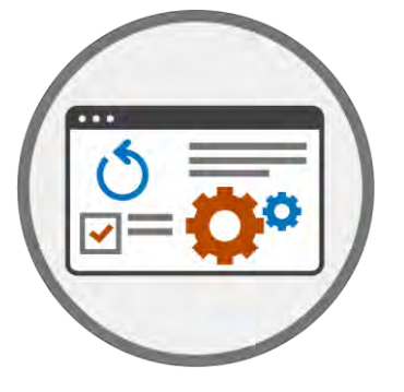
Challenges & Situations